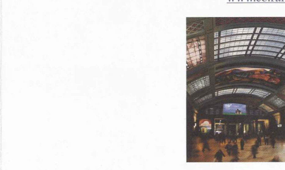
Artist's rendition of the future refurbished Union Depot

For more information on these Ramsey County services and more, go to: www.co.ramsey.mn.us