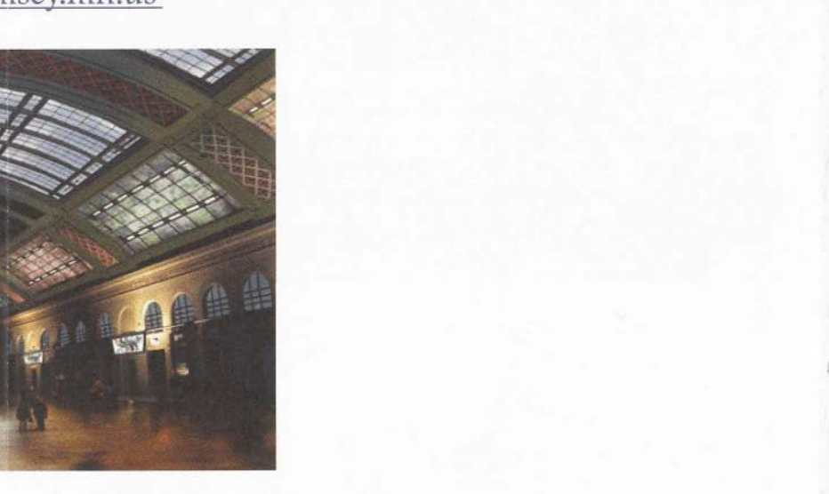
Artist's rendition of the future refurbished Union Depot

For more information on these Ramsey County services and more, go to: www.co.ramsey.mn.us