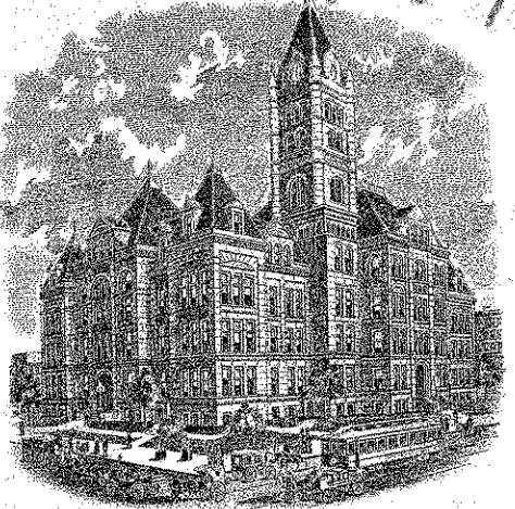
RAMSEY COUNTY COURT HOUSE.