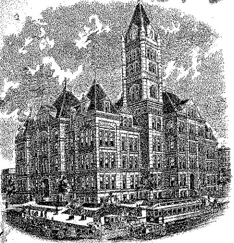
RAMSEY COUNTY COURT HOUSE.