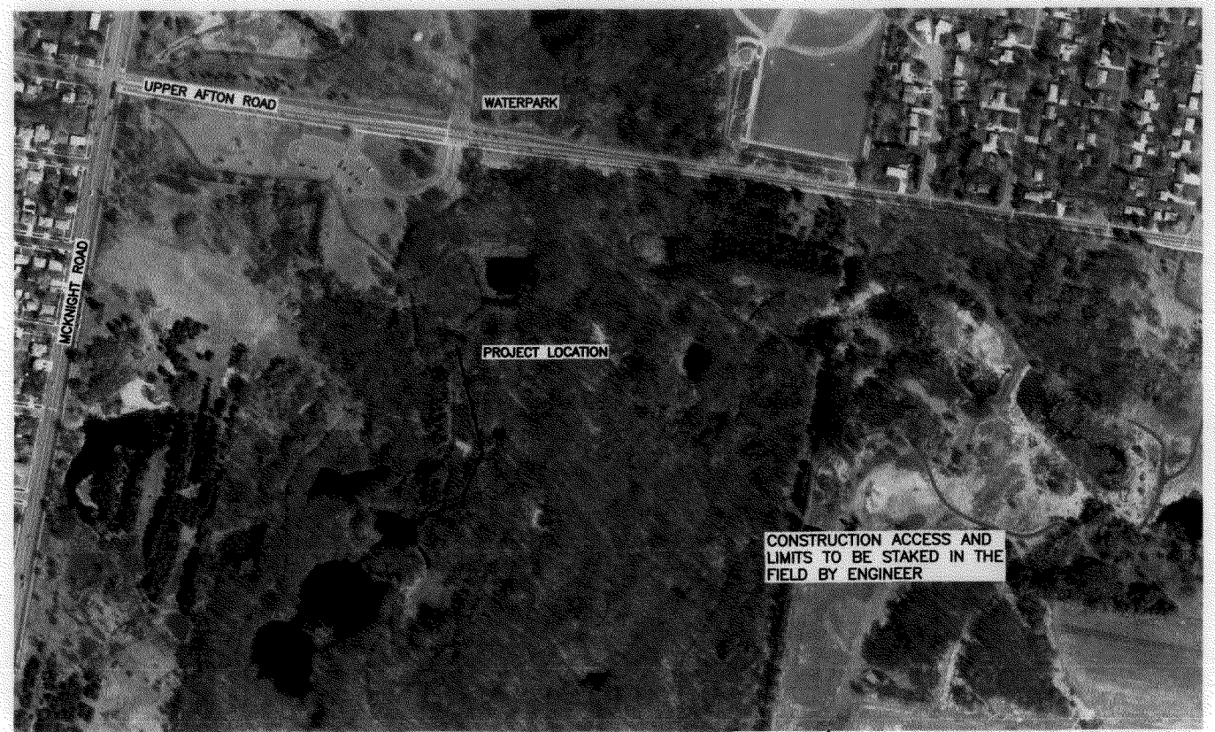
4 PLAN: SITE LOCATION MAP NOT TO SCALE

X:\a\l\l\2362282\LD_2005-RC_Park_Flood_Protection\cwg\cwg\Design_Model.dwg GDN: M:\a\l\l\2362282\LD_2005-RC_Park_Flood_Protection\Plan_Sheet_1.dwg Plot: 01.08/29/2005 10:54:23