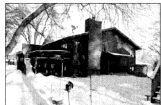
SOUTHWESTERLY SIDE OF 4419 CHATSWORTH STREET NORTH CITY OF SHOREVIEW, RAMSEY COUNTY, MINNESOTA