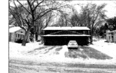
FRONT OF 4419/4421 CHATSWORTH STREET NORTH CITY OF SHOREVIEW, RAMSEY COUNTY, MINNESOTA