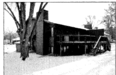
NORTHWESTERLY SIDE OF 4421 CHATSWORTH STREET NORTH CITY OF SHOREVIEW, RAMSEY COUNTY, MINNESOTA

ZONING REQUIREMENTS ZONED R2 - ATTACHED RESIDENTIAL DISTRICT MINIMUM LOT AREA - 6,000 SQ. FT. PER BUILDING FOOT PER UNIT LOAD 50 P.S.F. PER UNIT MINIMUM LOT WIDTH - 65 FEET FOR BUILDING MAXIMUM LOT COVERAGE - 50% MAXIMUM HEIGHT - 35 FEET BUILDING SETBACKS: FRONT - 35 FEET SIDE - 10 FEET (AS PER CITY OF SHOREVIEW ZONING CODE)