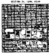
NEIGHBORHOOD MAP (NO SCALE)