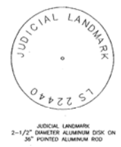
JUDICIAL LANDMARK 2-1/2" DIAMETER ALUMINUM DISK ON 3/8" POINTED ALUMINUM ROD