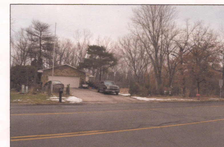
SOUTHERLY SIDE OF 1779 LAKE VALENTINE ROAD CITY OF ARDEN HILLS, RAMSEY COUNTY, MINNESOTA