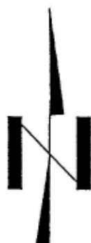
SKETCH OF REFERENCE TIES